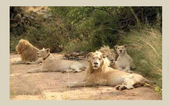
Q13: Some say the White Lions in your Reintroduction Programme are being "bred in captivity" because the lions are kept in cages. Is this true?

By 2013, three prides of un-imprinted White Lions had been successfully reintroduced to the free-roaming conditions on the White Lion Trust's 2000 hectare wildlife area in the natural habitat of the Greater Timbavati / Kruger Park Region, and were hunting as effectively as the wild tawny lions studied in the same free-roaming wildlife area [Turner et al. 2015]. Two of the White Lion groups were then successfully integrated with wild tawny lions, since White Lions were naturally born to tawny prides. A new blood line of white lions of high genetic integrity was introduced in 2017 - two free-roaming white lions donated by Pumba Game Reserve, South Africa.