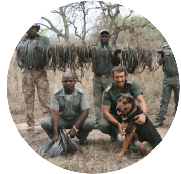
Effective counter-poaching interventions.

While the first strategy carries no cost, the other two are financially onerous on the Global White Lion Protection Trust.