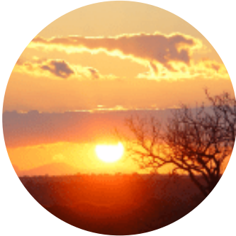
Daily Celebration of Nature

Each of our properties has a different risk profile. Until we achieve a world in which Lions, Land and People flourish in Harmonious Coexistence , we need to ensure the protection of Nature and her sentient beings. At the Global White Lion Protection Trust , we achieve protective measures through three fundamental strategies: